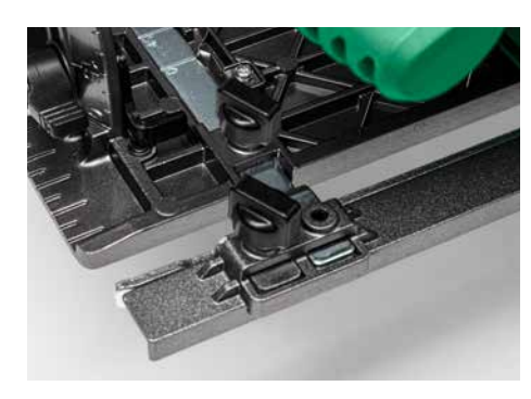
Guide rail adapter compatible with HiKOKI, Makita, Milwaukee, Festool, Metabo, and Hilti.