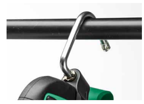
Big rafter hook for convenient storage on the jobsite.