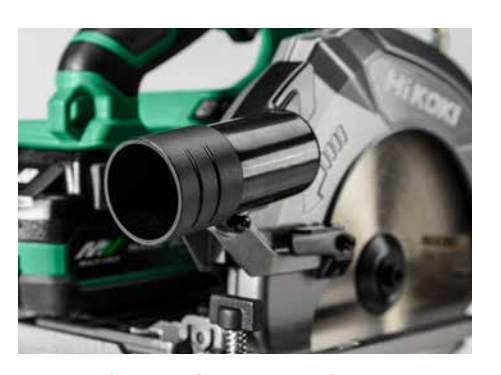
Dust adapter for use with vacuum cleaners for a clean workspace.